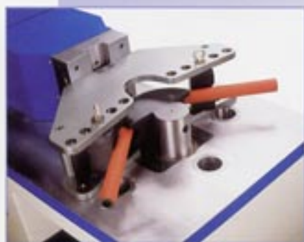
Pipe bending tool for up to 2" pipe to 90° angle