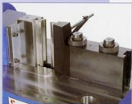
Multi-vee bending tool for thin plate