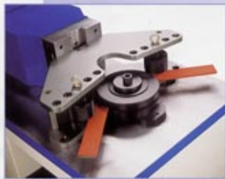
Flat plate edge bending tool for up to 50mm(w)x12mm(t)